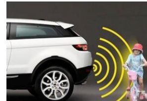
<Rear warning devices>