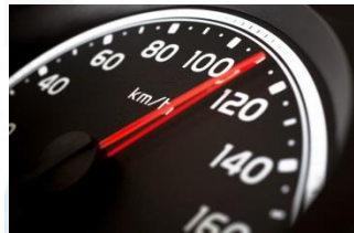
<Speed limit device>